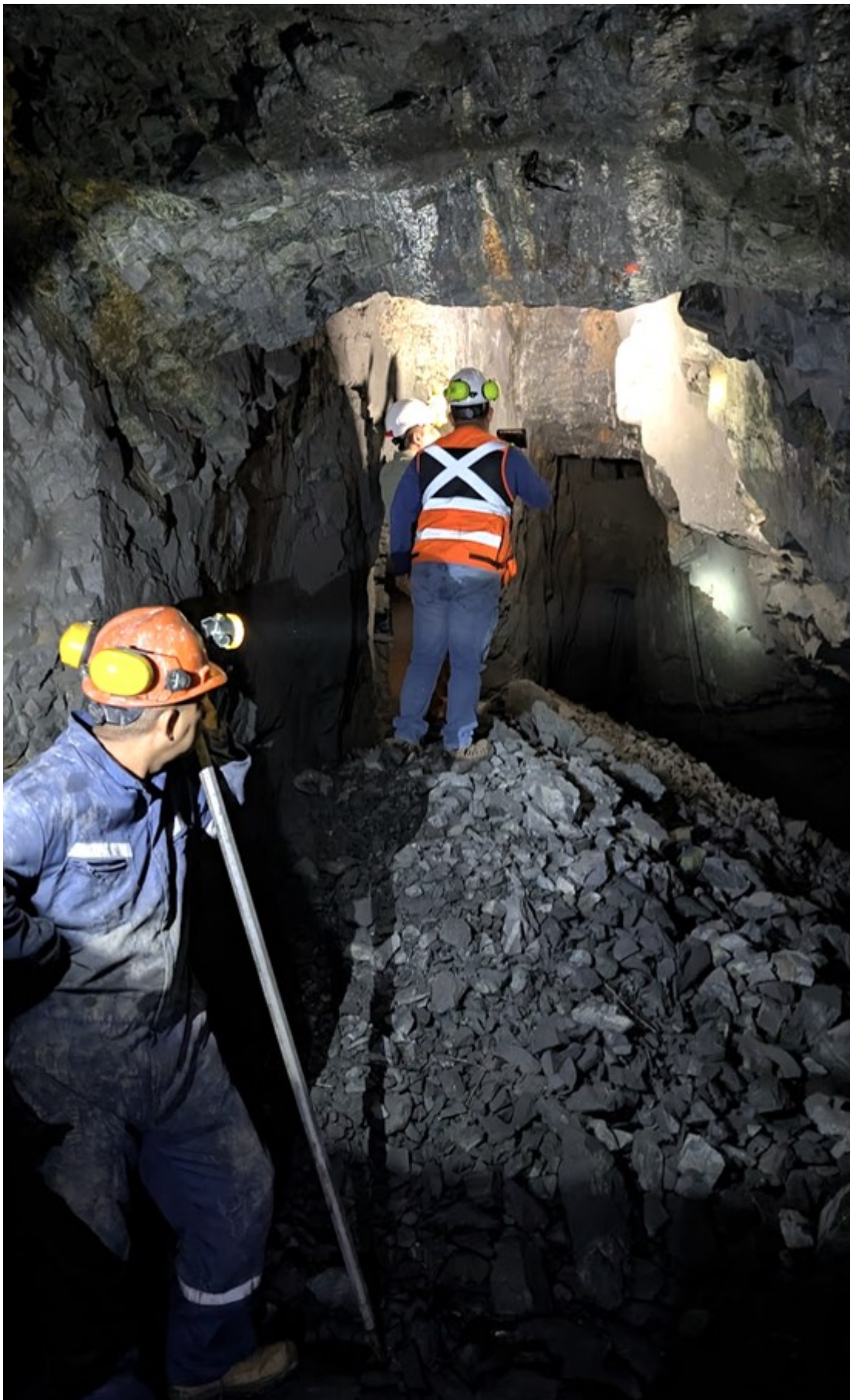
Figure 2: Inspection of Extraction Area at Santa Beatriz.

To view an enhanced version of this graphic, please visit: