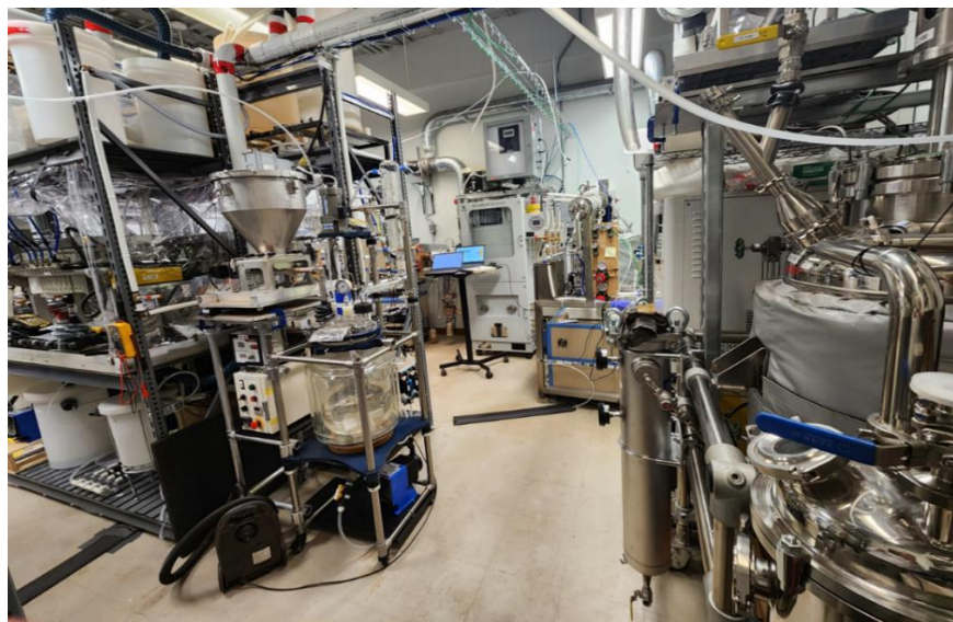
Figure 2: Pilot plant setup at the Boucherville facility