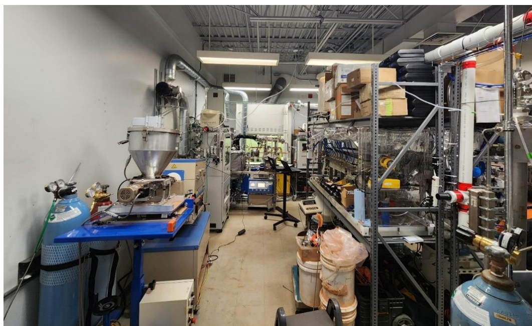
Figure 1: Pilot plant setup at the Boucherville facility

The most recent update can be found in section 2.5 above.