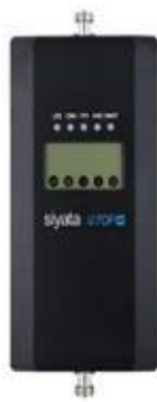
U70P In-Building Booster

Cellular boosters are also offered by Core AI with approximately 30 million of these devices sold globally every year. Core AI manufactures and sells Uniden® Cellular boosters and accessories for enterprise, first responder and consumer customers with a focus on the North America markets. Cellular communication provides a robust, secure environment not just for remote workers, in-home and in-vehicles; but also for restaurant patrons who wish to download menus; for patients at pharmacies who need to verify identity and download scripts; for remote workers who require strong clear cellular signals; and for first responders where connectivity literally means the difference between life and death - just to name a few examples. The vehicle vertical in this portfolio complements Core AI's rugged handsets and in-vehicle devices as these sales can be bundled through the Company's existing sales channels.