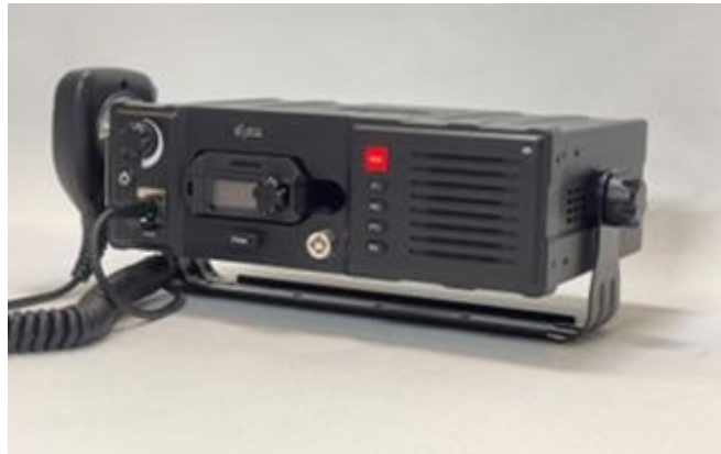
VK7 Vehicle Kit

power and can also connect to our cellular amplifier for better cellular connectivity. The pending patent for the VK7 Vehicle Kit provides temperature control by heating the VK7 in cold environments, and cooling the VK7 in hot environments. The VK7 can also be equipped with an external remote speaker microphone (“RSM”) to ensure compliance with hands-free communication legislation.