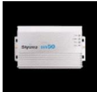
UM50 In-Vehicle Booster