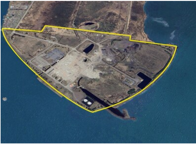
Image: "Aerial view of the Mission Island Lands, a 183-acre industrial property in Thunder Bay, Ontario."