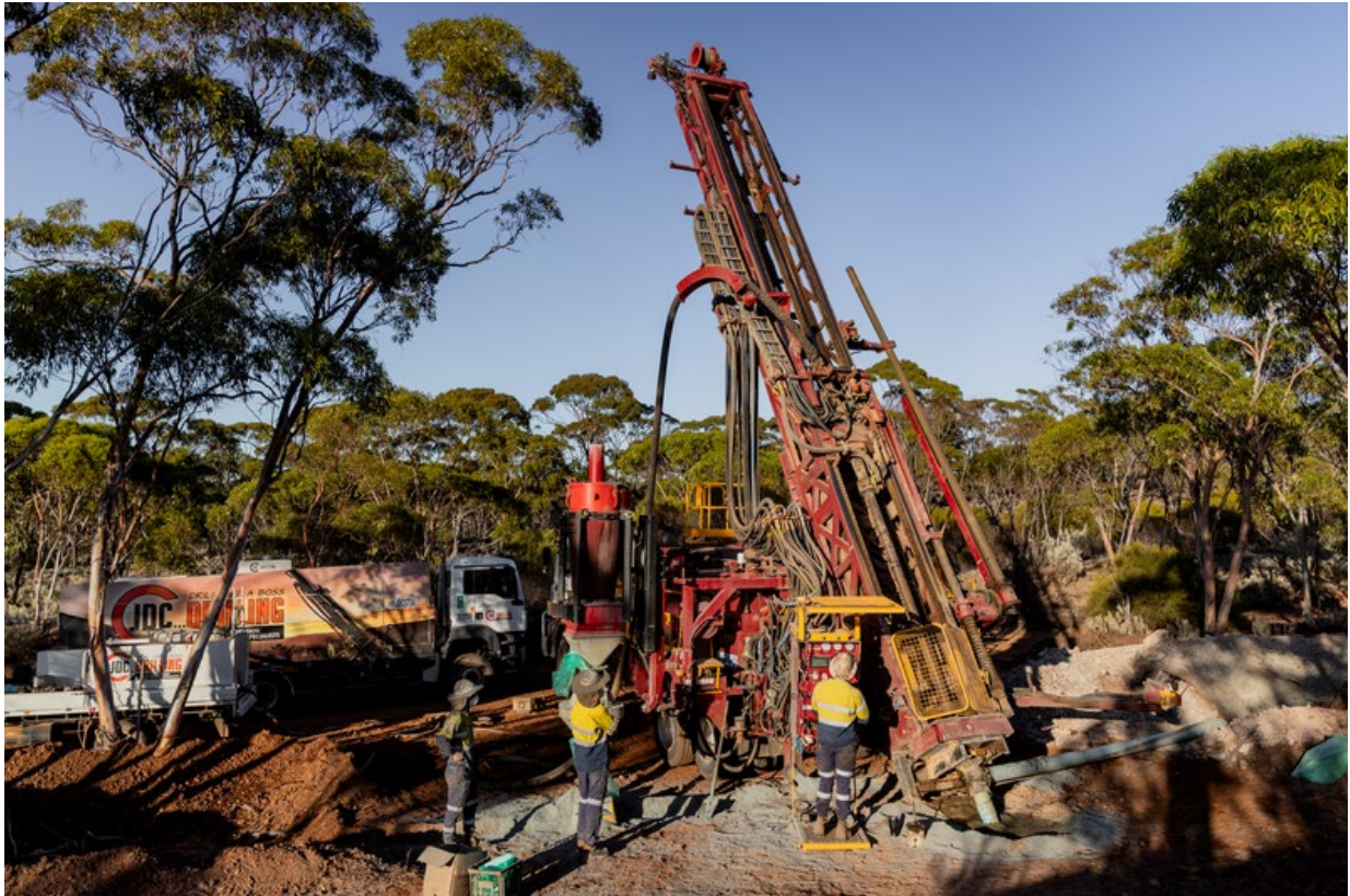
Figure 1: Ongoing Drilling at Hopes Hill.