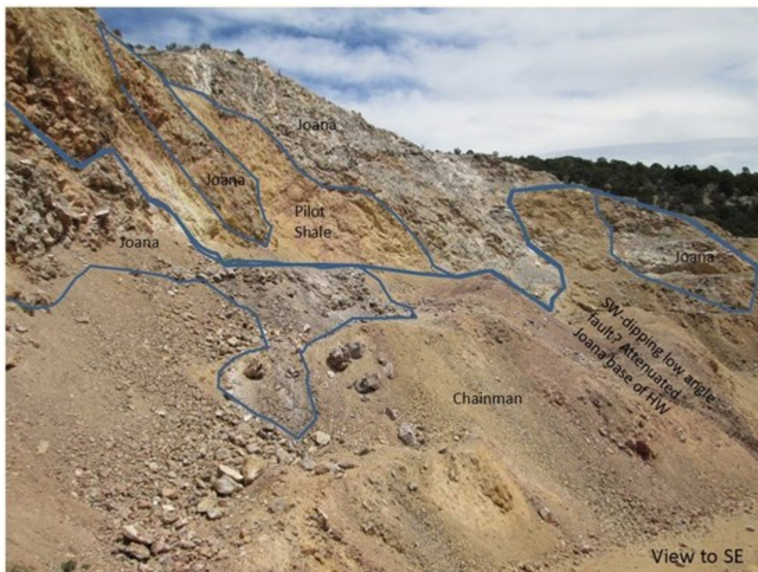
Figure 3: Discovery Ridge Pit showing delineation between the Pilot Shale, Chainman Shale and the Joana Limestone formations

including low-angle thrust, low-angle normal, high-angle normal, and high-angle strike-slip faults that have yet to be comprehensively mapped and understood (see Figure 3).