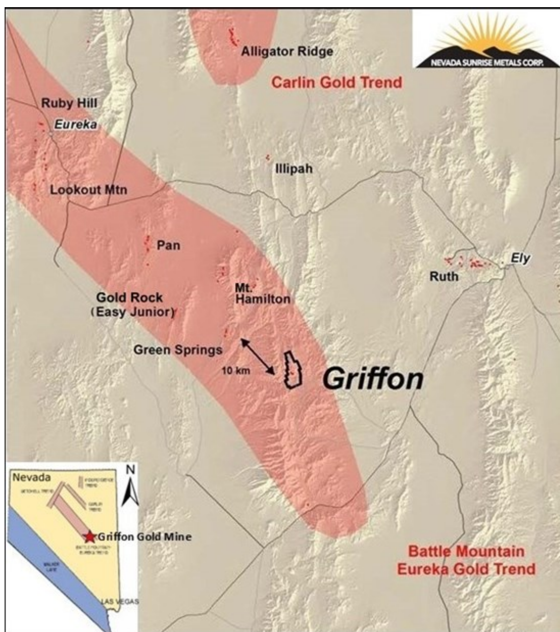
Figure 1: Griffon Gold Mine Project Location, White Pine County, Nevada

Vancouver, British Columbia--(Newsfile Corp. - February 20, 2025) - Nevada Sunrise Metals Corporation (TSXV: NEV) (OTC Pink: NVSGF) (" Nevada Sunrise " or the " Company ") is pleased to announce that it has signed a mining lease purchase agreement (the "Agreement") with an arm's-length vendor for the Griffon Gold Mine Project (" Griffon ", or the " Project ") located approximately 50 kilometres (33 miles) southwest of Ely, Nevada. The Project consists of 89 unpatented mineral claims totaling approximately 1,780 acres. Griffon is situated at the southern extension of the fertile Battle Mountain-Eureka gold trend in east-central Nevada, which is host to both past-producing and operating gold mines, and a number of significant gold deposits. Gold was mined at Griffon in two open pits from 1998 to 1999 and was reported to have produced 62,661 ounces of oxide gold until its premature closure ( Source: Nevada Division of Minerals, "Major Mines of Nevada", published 1998 and 1999 ).