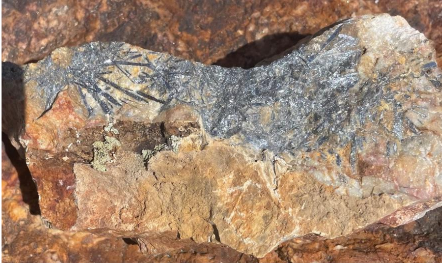
Figure 2. High-Grade Stibnite Quartz Vein