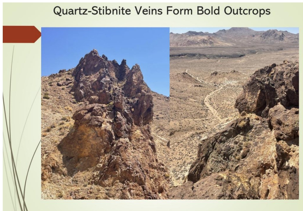
Figure 1. Outcrop Examples of Quartz-Stibnite veins

AZS has initiated exploration to focus on the antimony potential of the project given that antimony is a “critical metal” currently trading at US$57.50/lb.