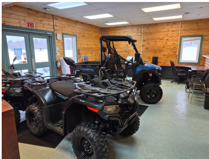
Figure 3: New Age Metal’s and MetalQuest Mining Kenora-based field operations office main entry with field side by sides