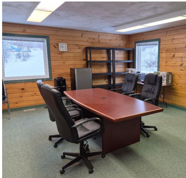
Figure 5: New Age Metals and MetalQuest Mining Kenora-based field operations board room office