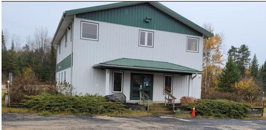
Figure 2: New Age Metal’s and MetalQuest Mining Kenora-based field operations office and core facility.