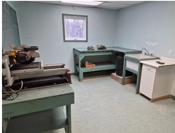
Figure 4: New Age Metals and MetalQuest Mining Kenora-based field operations office core cutting room