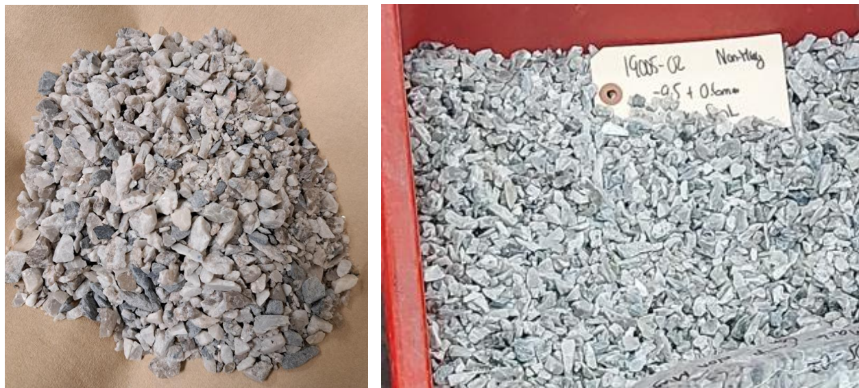
Figure 2: Crushed whole rock pegmatite with 15% non-pegmatite host rock dilution – 1.05% \text{Li}_2\text{O} (left); DMS spodumene concentrate feed for the downstream test work – 6.2% \text{Li}_2\text{O} and 0.60% \text{Fe}_2\text{O}_3 (right).

The spodumene concentrate was produced using a simple DMS-only (+ magnetic separation) flowsheet which was fed by a master-composite of drill core material, representing anticipated early mine-life (Figure 2). This master composite included 15% non-pegmatite host-rock dilution to better represent a conservative (in terms of dilution content) commercial mining operation scenario.