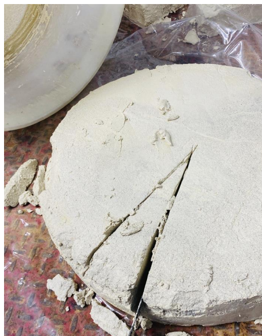
Figure 4: Filtering stage and resultant filter cake post water-leaching and impurity removal.