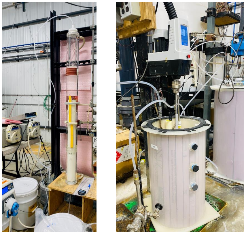
Figure 3: Water-leach and ion exchange impurity removal stages of the lithium hydroxide flowsheet.

The Company has recently completed a significant core sampling program to provide additional representative material for the next phase of mineral processing testwork in support of the ongoing Feasibility Study on the CV5 Spodumene Pegmatite. This program will provide significant quantities of representative spodumene concentrate for any future downstream test programs.