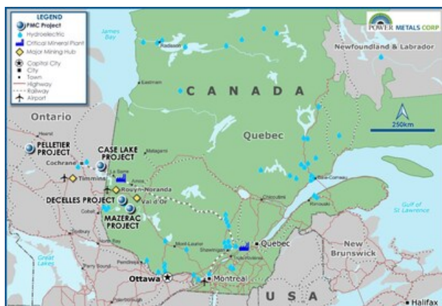
Figure 1 – Power Metals Corp Project Locations Map in Ontario and Quebec Canada

The Mazerac Property is located approximately 30 km east of Power Metals' Decelles property near well-established mining camps in the Abitibi region of Canada and is accessible by network of mining-grade forestry roads. The Mazerac property contains 259 claims that cover 14,700 hectares of LCT prospective ground near the mining centre of Val-d'Or and Rouyn-Noranda. The regional geology of Mazerac is similar to Decelles where S-type LCT prospective, pegmatite bearing, granites of Decelles Batholith intrude into metasedimentary units of the Pontiac Group. Spodumene and Beryl bearing pegmatites have been reported historically within the Pontiac sub-province in association with S-type garnet-muscovite granite (Figure 1)