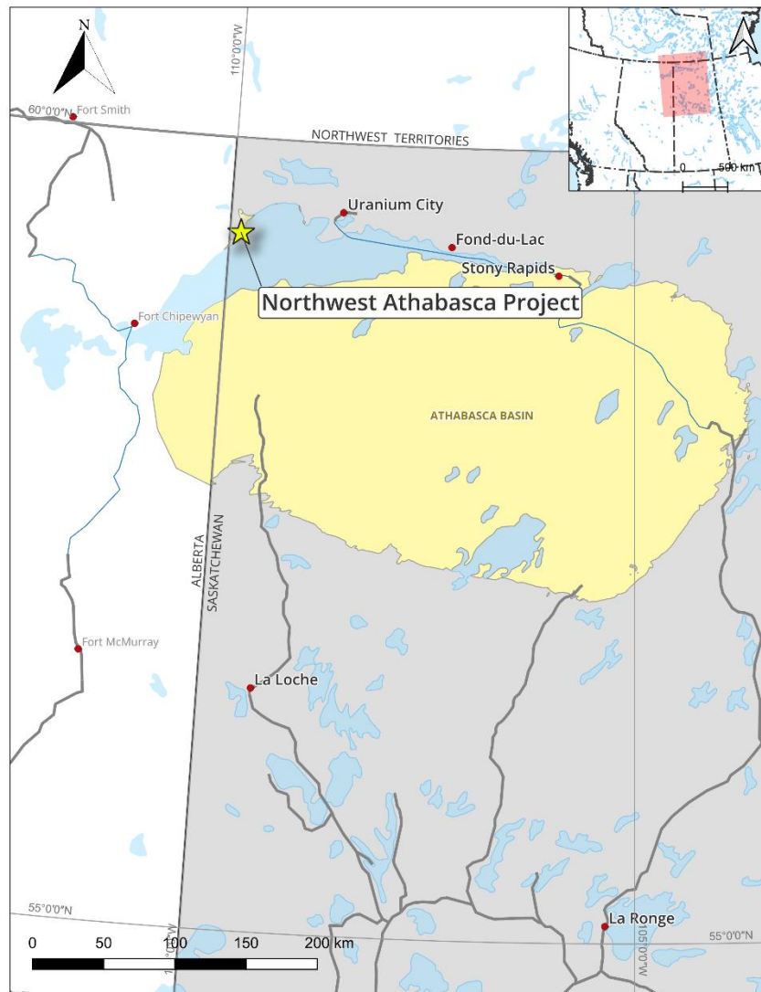
Figure 1 Location of the Northwest Athabasca Project along Lake Athabasca in northwestern Saskatchewan. The closest communities are Uranium City, Fond du Lac and Fort Chipewyan. The western margin of the property is located along the Alberta – Saskatchewan Border.